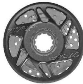
( Back Side )