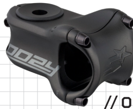
// OOZY TRAIL 2

Designed for XC, Trail and All Mountain applications, where a slightly longer reach is sometimes required.