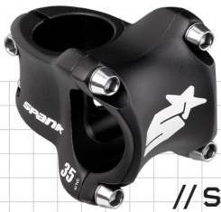
// SPIKE RACE 2

The second generation of SPANK's top selling stem historically, now at an amazing retail price of just 49.90. Perfect for everything from Enduro Race to Freeride on a budget.