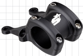
// SPIKE DIRECTOR 2

The third generation of Spank's legendary direct mount, now available at the incredible price of just 49.90. With a traditional reach, and low rise, the Director 2 Stem keeps full length DH cockpits stiff and compact. The low rise also helps to keep riders who favor a 50mm reach in a balanced position with weight on the front wheel for traction.