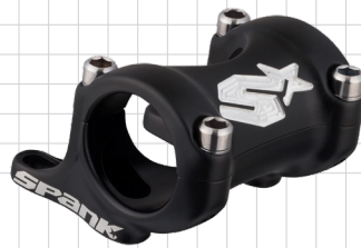
// SPIKE 25/30 DM

Exemplifying Spank's Human Factor design. The 25/30 DM features an ultra-short and adjustable 25-30mm reach, due to Spank's patented design, which places front lock down bolts inside the barclamp. Rise can also be adjusted with an included adapter kit. Perfect for shorter riders, or for average sized riders preferring a short reach and high rise.